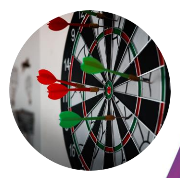
Agile Industry Mindset (AIM)