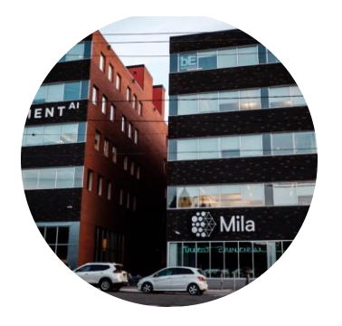
Telecom, IoT, & 5G