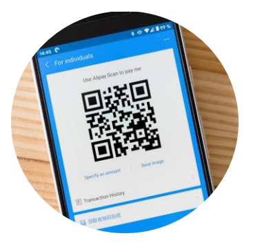
Intelligent Retail and Commerce